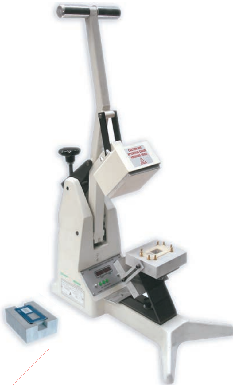
ALUMINIUM BLOCK FOR CERTICARD® PRE-ASSEMBLING OPERATIONS