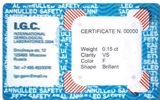
CertiCard ® - SEAL CARD BACK