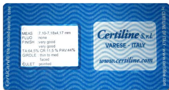
CertiCard ® - SEAL CARD BACK