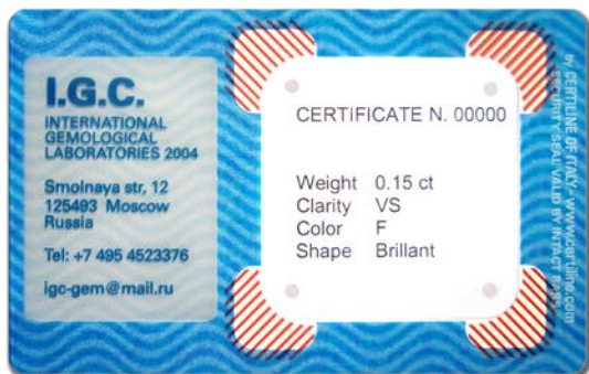
CertiCard ® - SEAL CARD BACK