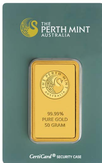
CertiCard ® - LODGING CARD