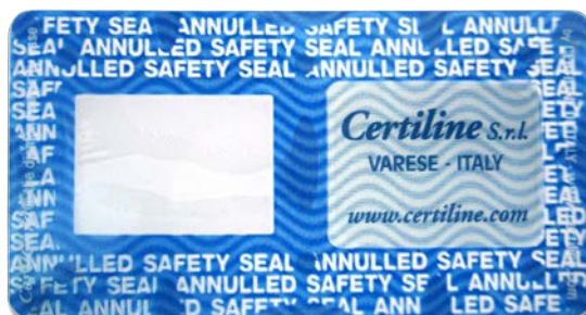
CertiCard ® - SEAL CARD BACK