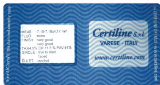
CertiCard ® - SEAL CARD BACK