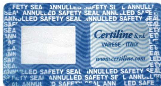
CertiCard ® - SEAL CARD BACK