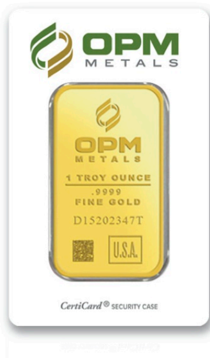
CertiCard® - LODGING CARD