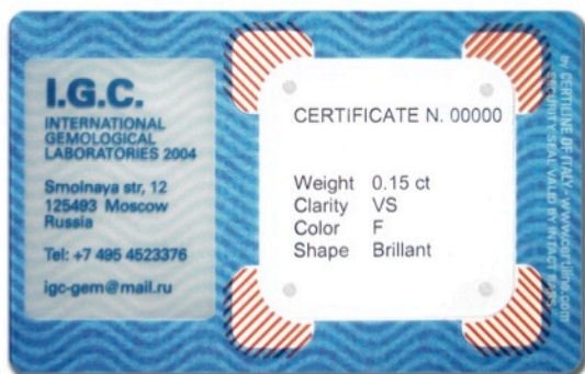
CertiCard ® - SEAL CARD BACK