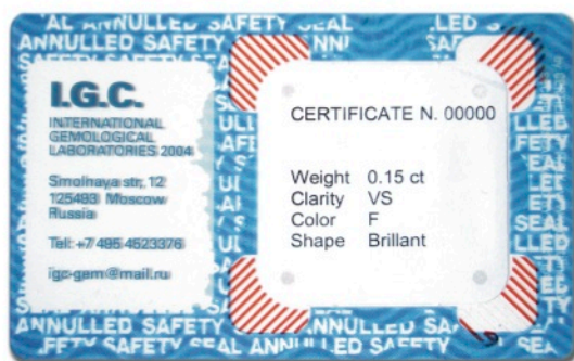
CertiCard ® - SEAL CARD BACK